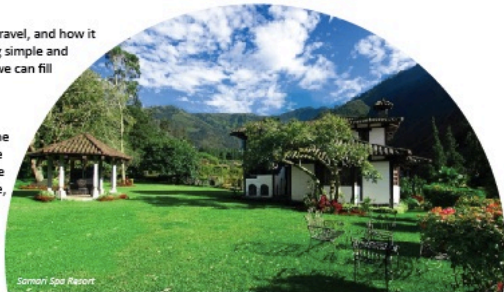
Samari Spa Resort

Each Arous World travel experience is tailor-made to suit the needs of an individual client or group.