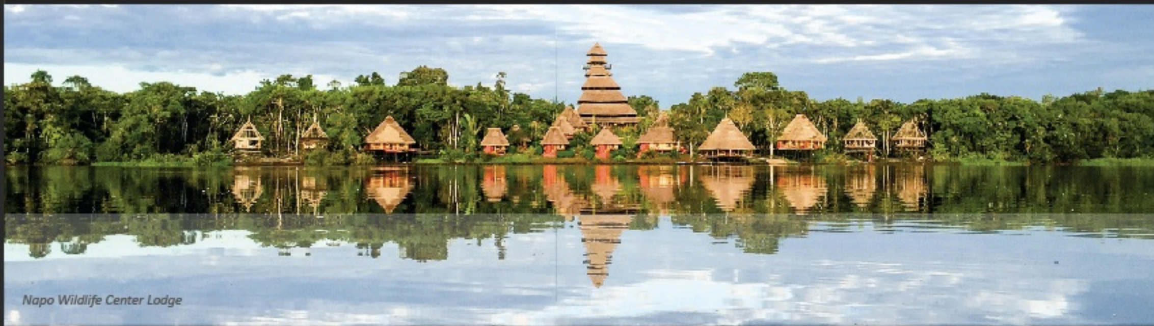
Napo Wildlife Center Lodge

In Our network of local tourism partners and suppliers are not only experienced and knowledgeable in their respective fields, but also passionate about responsible travel in Ecuador.